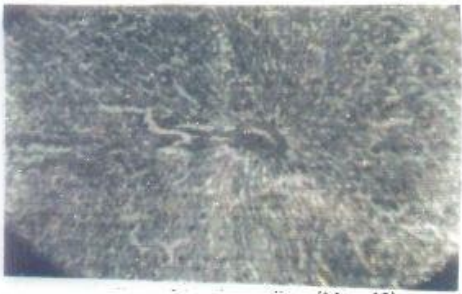
Plate 5 showing effect of Amalar on liver