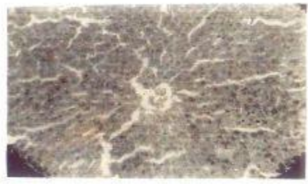
Plate 1 showing the effect of Chloroquine on liver