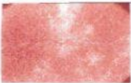
Plate 3 Showing the livers without drugs treatment